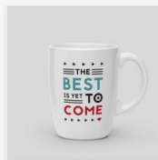
Mug The Best Is Yet To Come